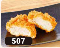
Tenderloin Katsu ヒレかつ $2.6