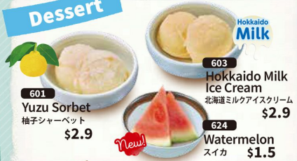
601 Yuzu Sorbet 柚子シャーベット $2.9