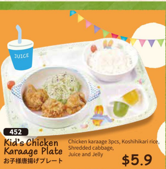
452 Kid's Chicken Karaage Plate Chicken karaage 3pcs, Koshihikari rice, Shredded cabbage, Juice and Jelly お子様唐揚げプレート $5.9