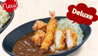
403 Deluxe Curry DX カレー Tenderloin katsu 1pc, Chicken karaage 2pcs M $16.9 L $19.2