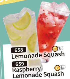
658 Lemonade Squash 659 Raspberry Lemonade Squash