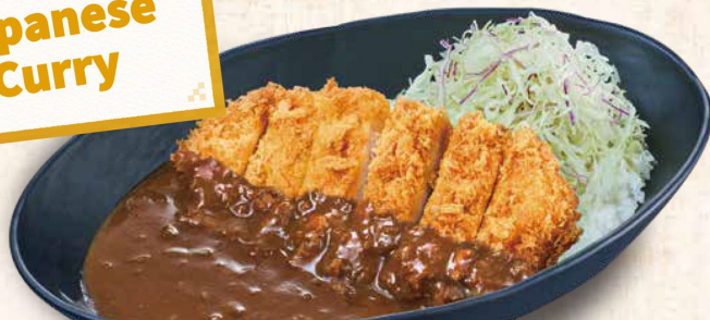
401 Loin Katsu Curry ロースかつカレー 80g Loin katsu 1pc M $10.9 L $13.2