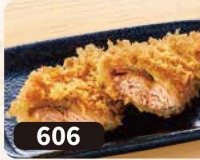
Salmon Fry サーモンフライ $4.0