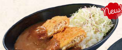
407 Mince Pork Katsu Curry メンチかつカレー Mince pork katsu 1pc M $10.9 L $13.2