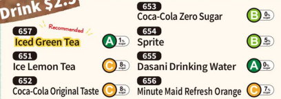
657 Iced Green Tea