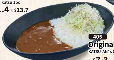
405 Original Curry カレー KATSU-AN's Original curry M $7.3 L $9.6