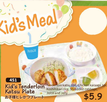
451 Kid's Tenderloin Katsu Plate Tenderloin katsu 1pc, Chicken karaage 1pc, Koshihikari rice, Shredded cabbage, Juice and Jelly お子様ヒレかつプレート $5.9