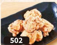
Chicken Karaage 唐揚げ 1pc $1.3 2pcs $2.5 5pcs $6.0