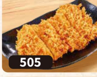
Chicken Katsu チキンかつ $4.9