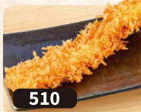
Calamari Fry イカフライ $3.0