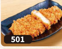
Loin Katsu ロースかつ 120g $5.3 80g $4.2