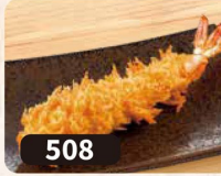
Ebi Fry エビフライ $4.5